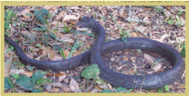
Black Racer Rodent control.