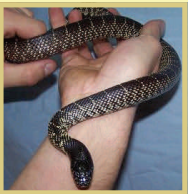
King Snake Venomous snake control.