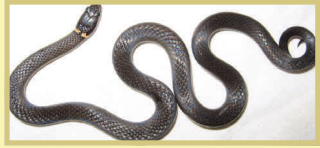
Ringneck Snake Termite control.

Florida's weather makes an excellent home for snakes. They play an important role keeping those populations under control. Here are some ways they help: